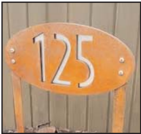
On A Driveway Sign