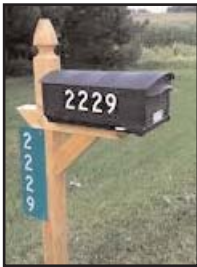
On Your Mailbox